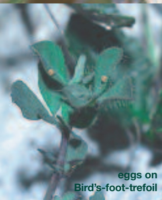
eggs on Bird's-foot-trefoil